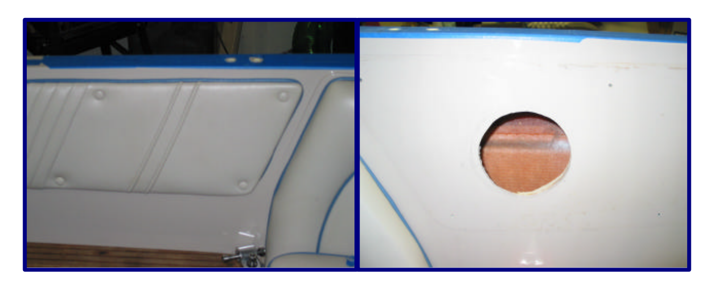
Figure 5 - Access to Underneath Deck