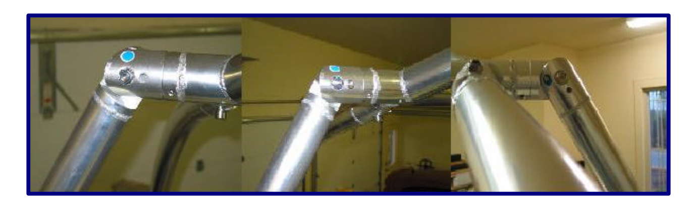
Figure 6 - Adding Stiffness