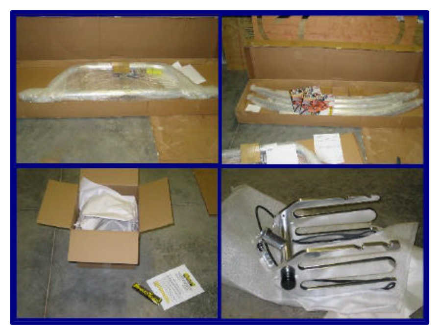
Figure 1 - Tower Arrival and Unpacking

I ordered my tower online during lunch one Friday afternoon. The tower arrived the following Monday during one of several Charlotte ice storms this winter. In addition to the tower, I ordered two board racks and the Quick Release Kit. The tower and accessories were delivered in two corrugated cardboard boxes (see Figure 1). Needless to say I was anxious to dive into this DIY winter project and immediately opened the boxes. The tower pieces and board racks were individually bubble wrapped and neatly packed. The remaining hardware was also individually wrapped in plastic and tightly packed in smaller corrugated cardboard boxes. Of course instructions were included too.