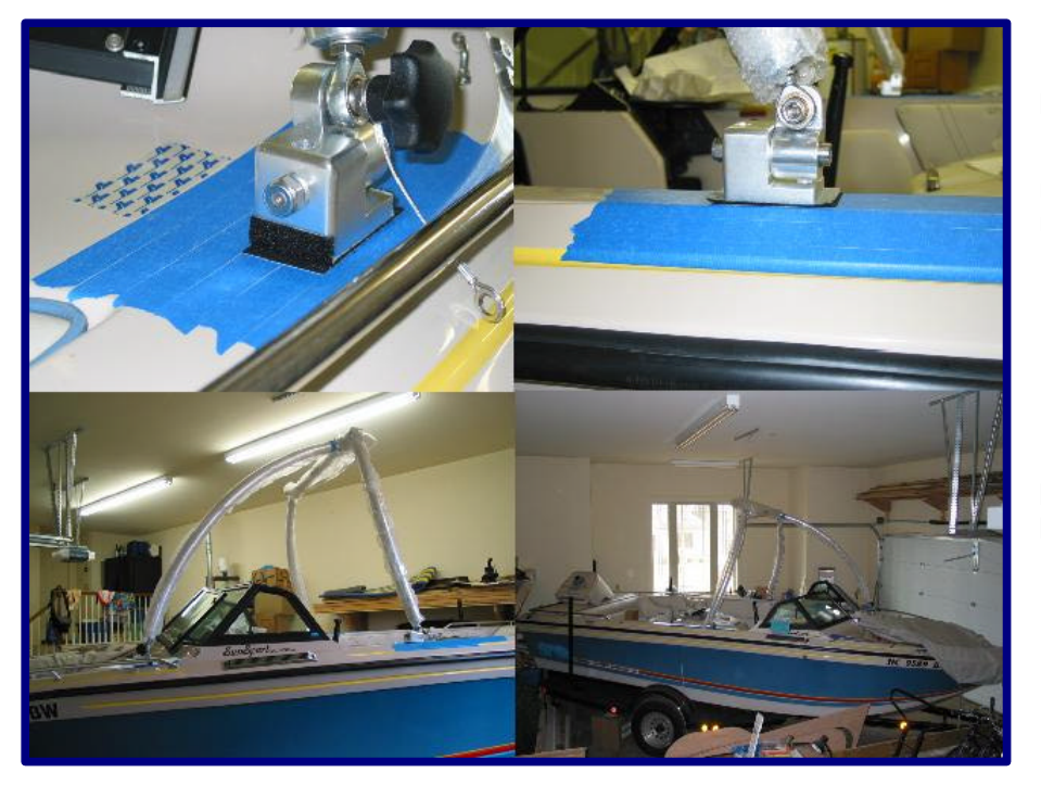
Figure 3 - Tower Layout

Upper left – front base Upper Right – rear base