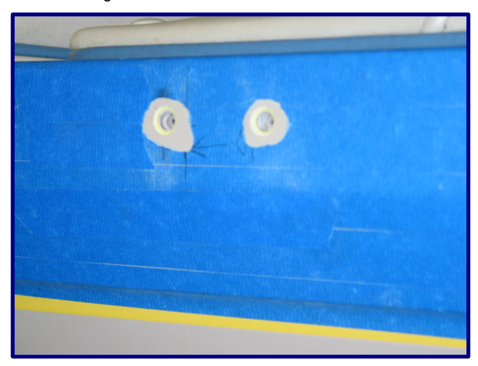
Figure 4 - Chamfered Mounting Holes

➤ The next issue I faced was access to underneath the deck. Because my boat has double sidewall construction, I removed the upholstered sidewall pads and cut a hole in the sidewall. It is conveniently sized at 5-1/4" so I could add speakers later if so desired.